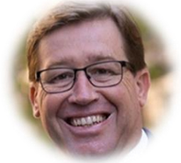
Hon Troy Grant, Inspector-General of Water Compliance