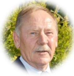
Mayor Craig Davies , Narromine Shire Council, Chair Region 10