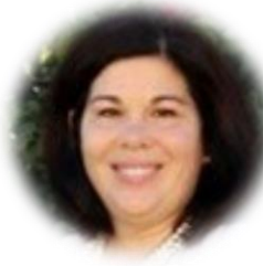
Mayor Samantha O'Toole , Balonne Shire Council, Chair Region 12