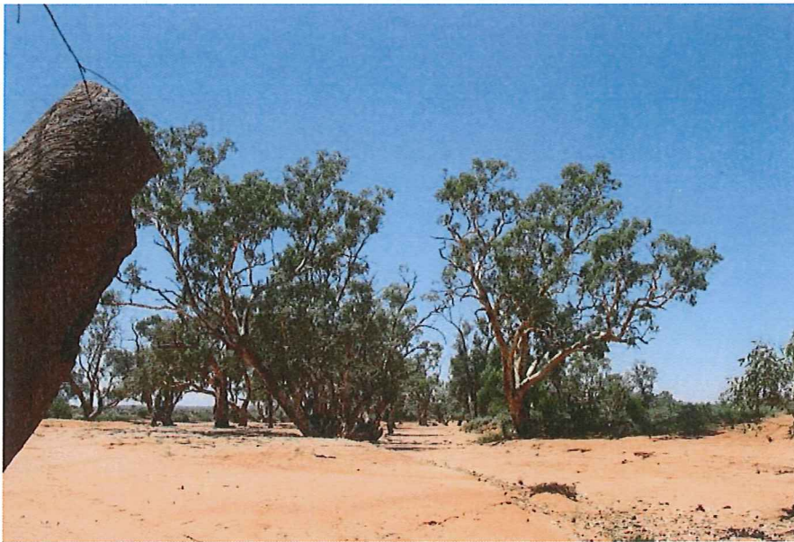
PHOTO: The largest of the lakes which make up the Menindee Lakes storage system is now bone dry. (ABC News: Ginny Stein)

Although recent rain extended supplies, it is a crisis that is yet to be solved.