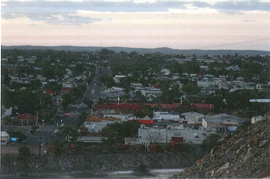
PHOTO: The town of Broken Hill does not have a reliable source of water and is facing another water crisis.

Broken Hill is Australia's longest lived mining city. BHP Billiton, one of the world's largest mining companies, has its roots in the town.