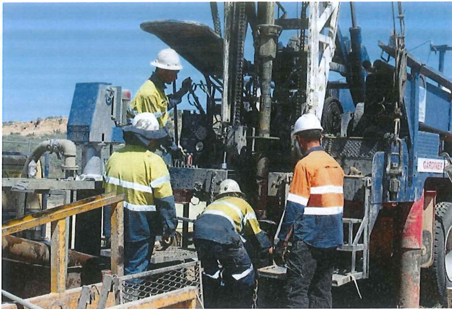
PHOTO: A drilling crew sets up a drilling rig to search for ground water near Menindee.