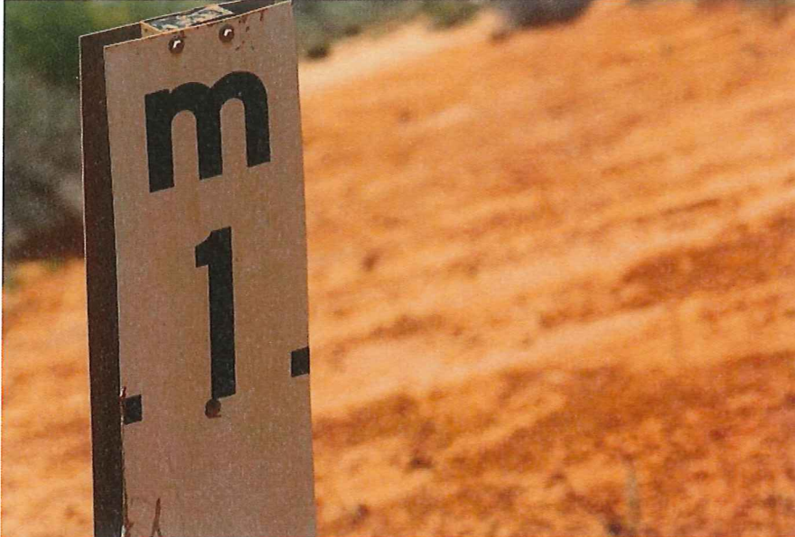
PHOTO: This Broken Hill flood marker hasn't been needed for a while.

For the third time this century, one of Australia's most iconic inland cities is facing a critical water crisis.