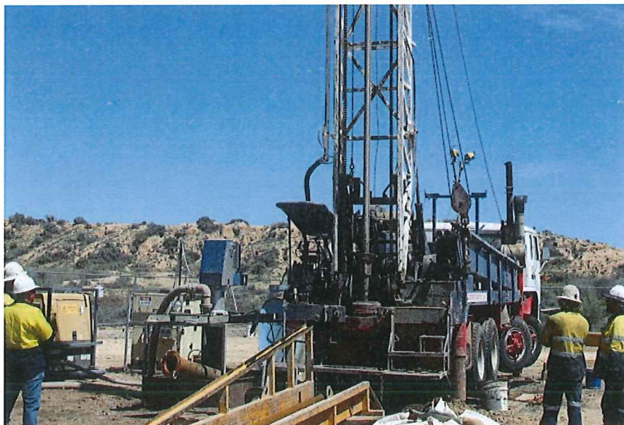
PHOTO: Workers watch a water drilling rig as it drills into the earth near Menindee. (ABC News: Ginny Stein)

The simple truth is the region needs rain.